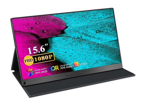
Portable Computer Monitor For Your Laptop

FHD 1080P IPS Screen: NEWSOUL HDR portable monitor delivers a vivid image and truly immersive viewing experience with stunning 1920 x 1080 resolution visuals & awesome color reproduction.